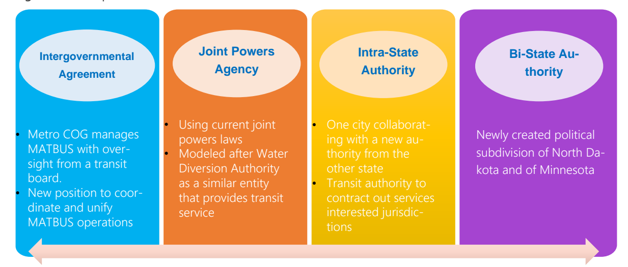
Figure 2. Comprehensive Governance Alternatives Overview