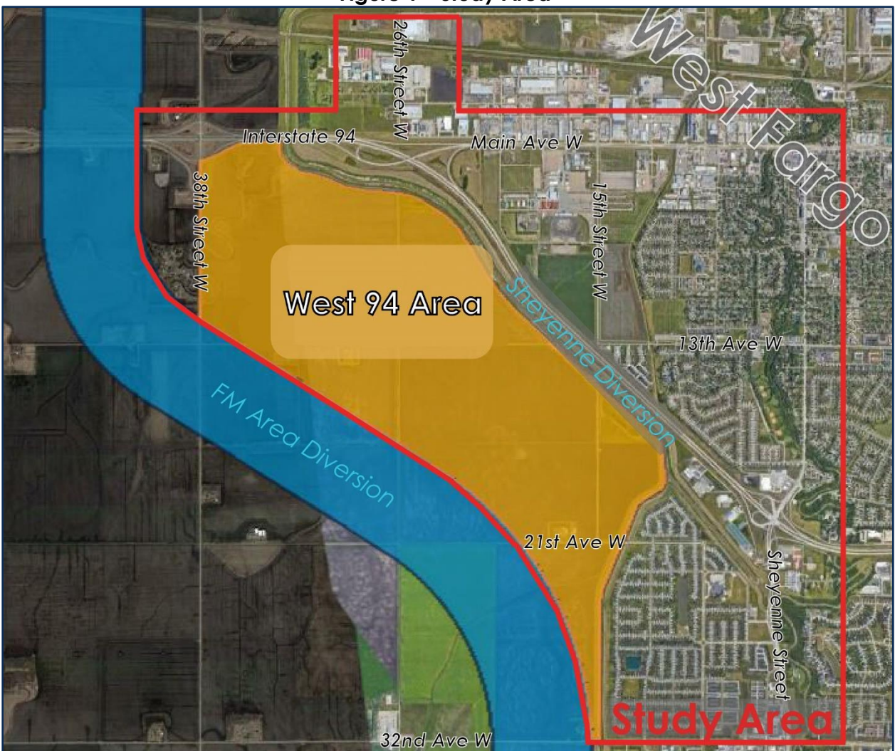
Figure 1 – Study Area