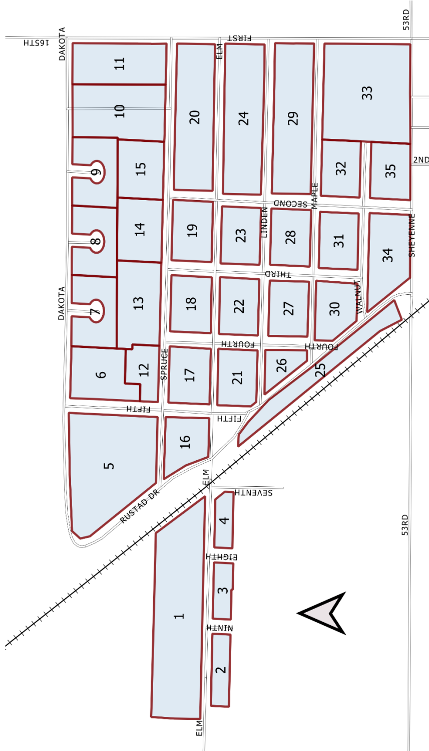
MAP A Renaissance Zone Map

The following map identifies the geographic boundaries and blocks of Kindred's Renaissance Zone.